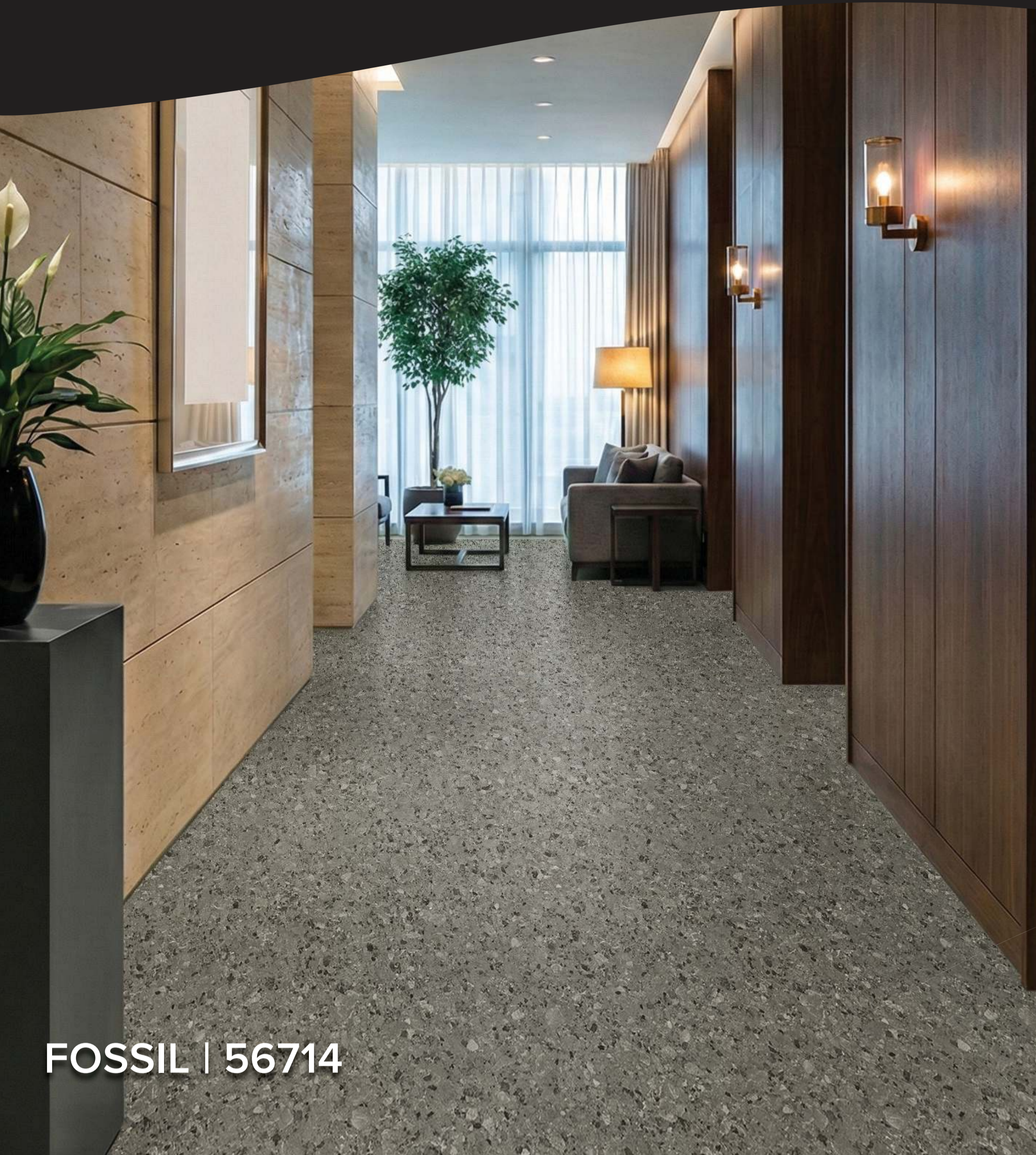
FOSSIL | 56714