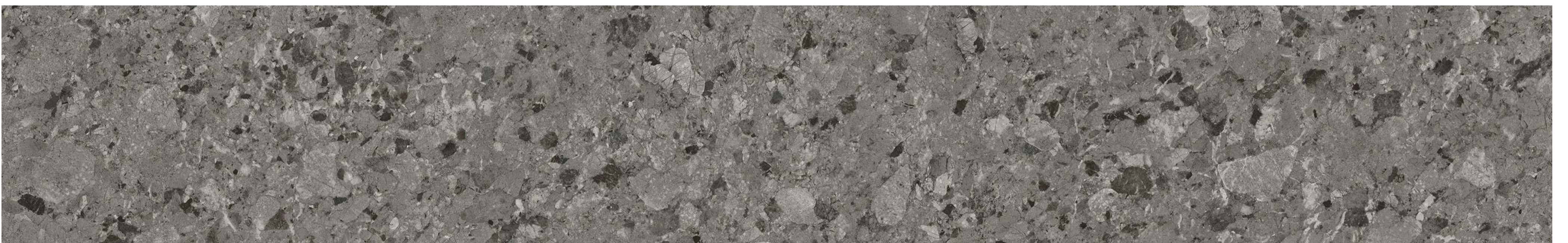
FOSSIL | 56714