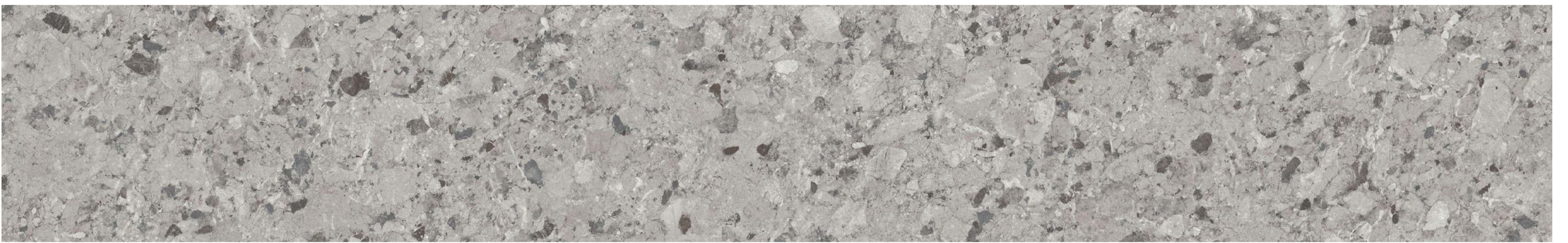
FLINT | 56713