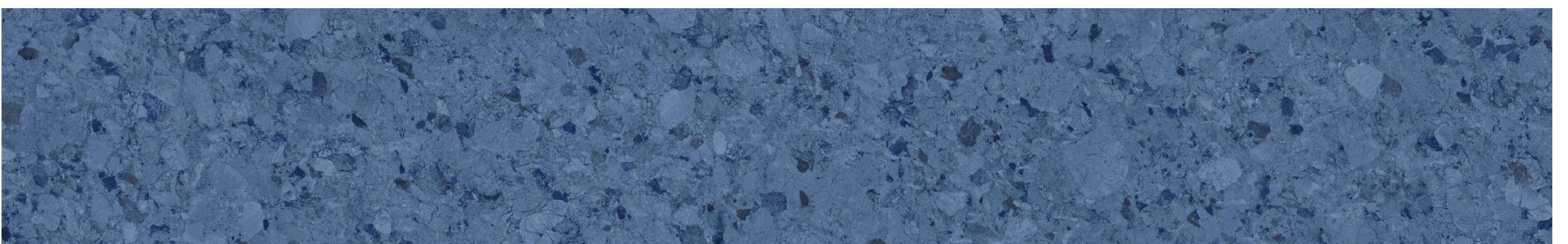
BLUE PEARL | 56717