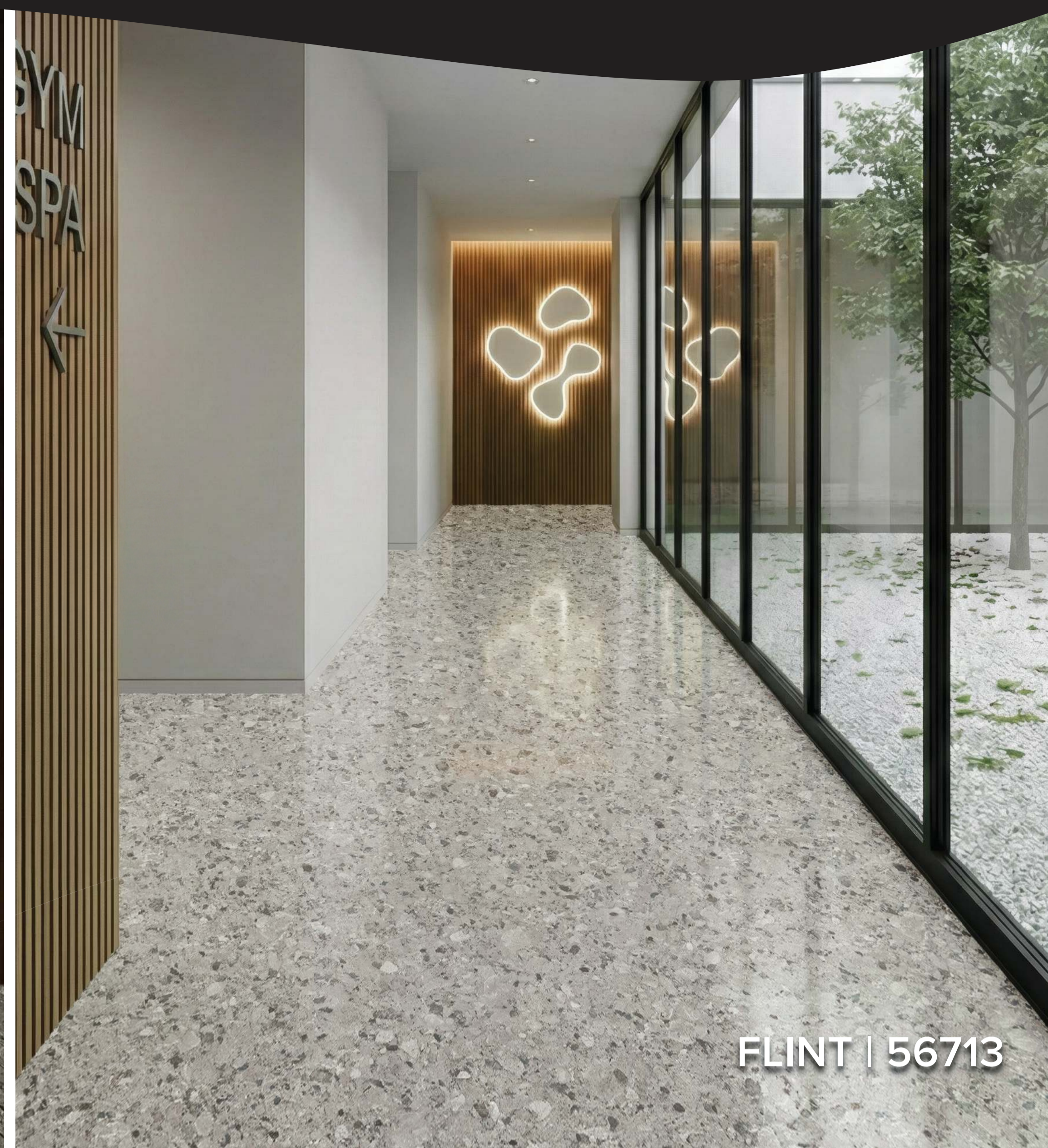
FLINT | 56713