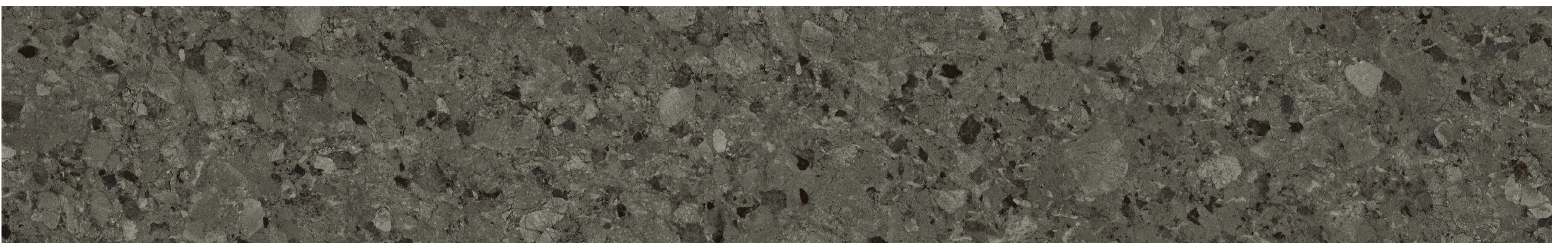
GRAPHITE | 56715