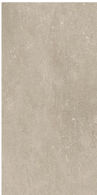
LUNAR | 42542