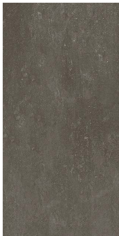
UMBER | 42544