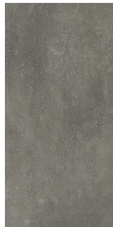
URBAN | 42545