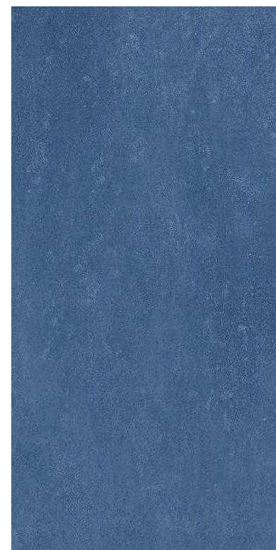
INDIGO | 42547