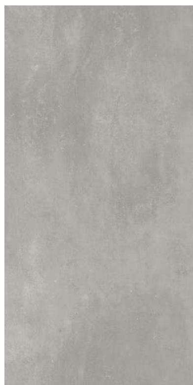
TITANIUM | 42527