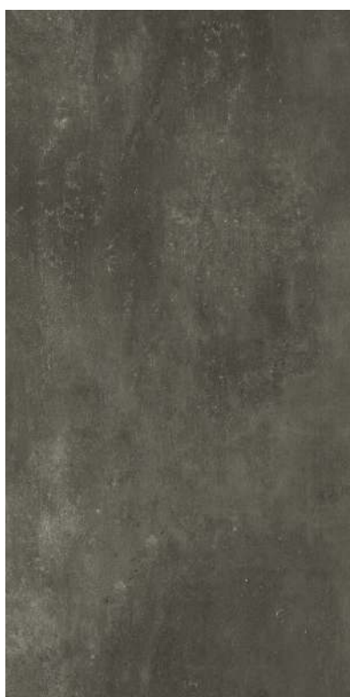
IRON | 42504