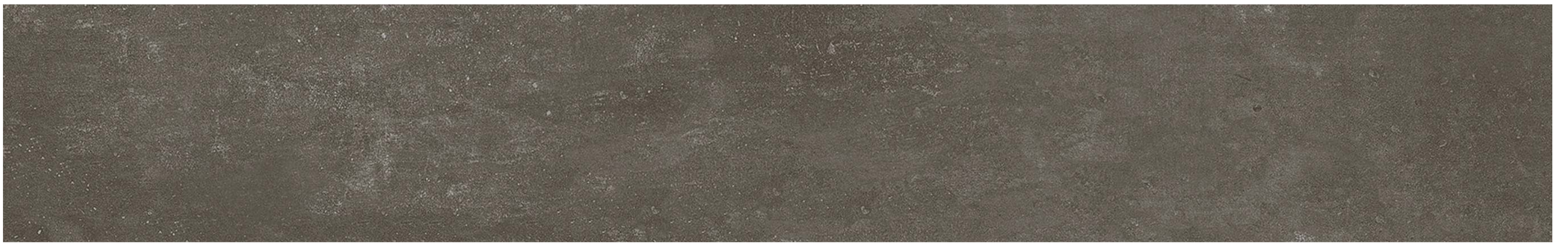
UMBER | 42544