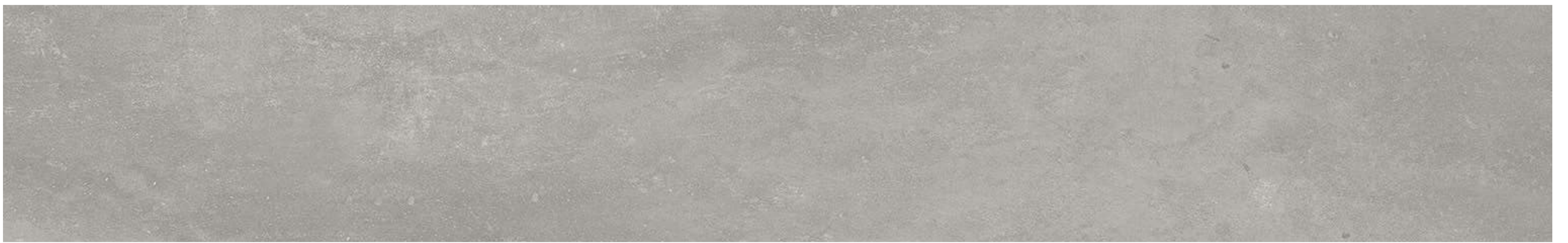
TITANIUM | 42527