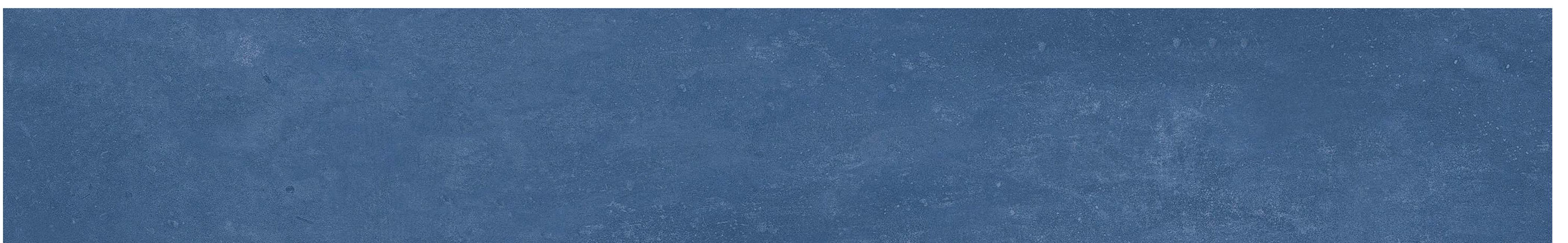
INDIGO | 42547