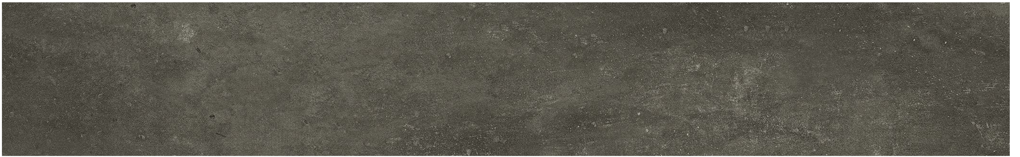
IRON | 42504