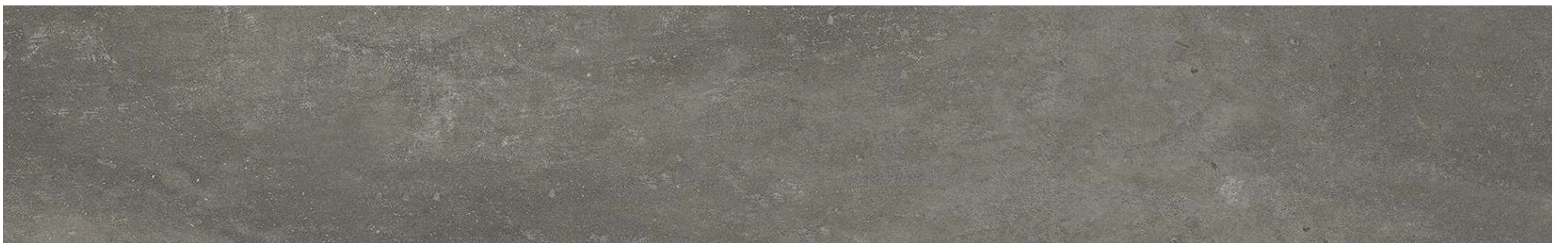
URBAN | 42545