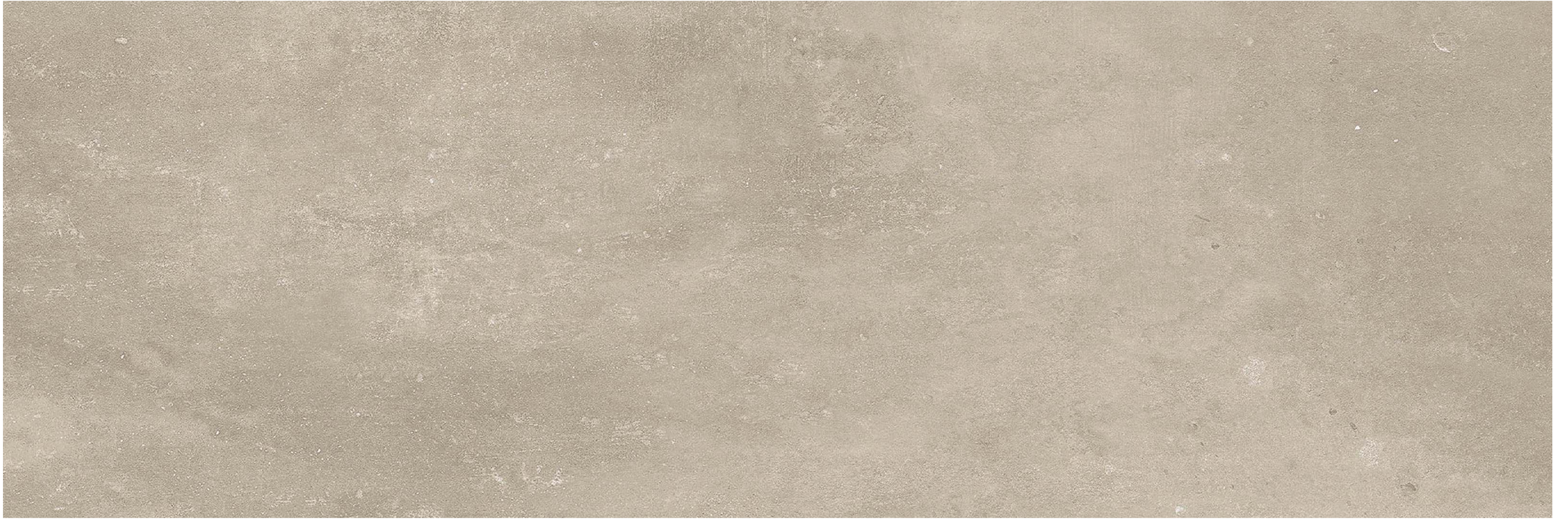
LUNAR | 42542