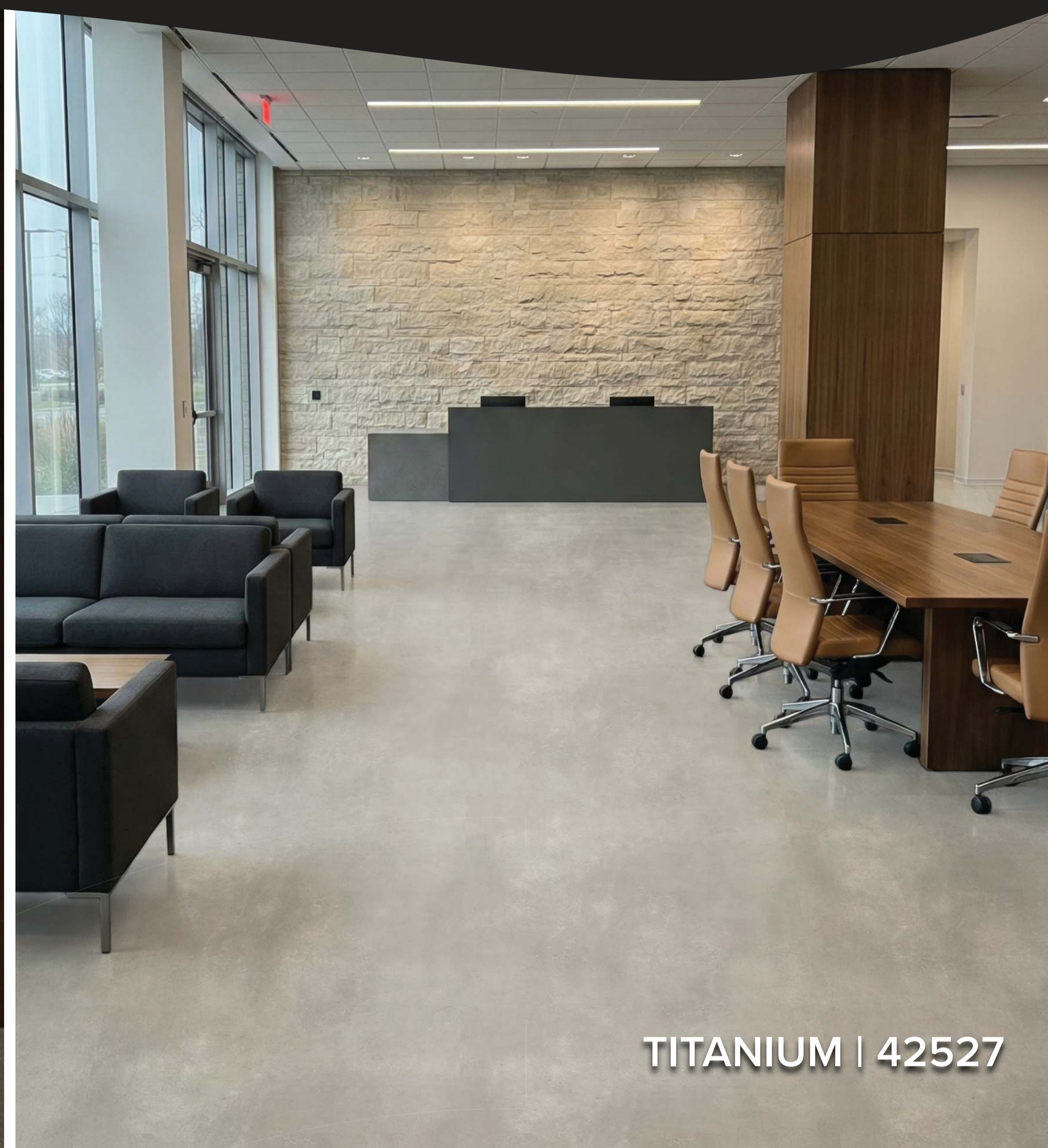
TITANIUM | 42527